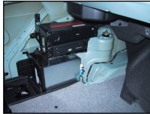
E46 3 Series Saloon/Coupe