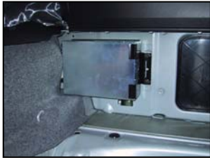
E46 3 Series Convertible