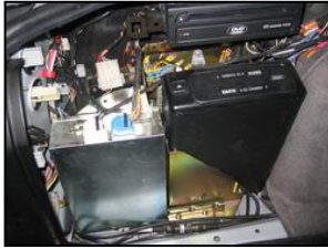
E38 7 Series