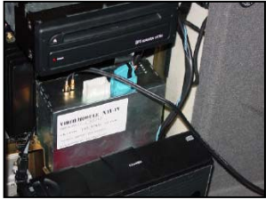
E39 5 Series

Installation is made at the factory TV Tuner, Locate TV Tuner box in rear of vehicle: